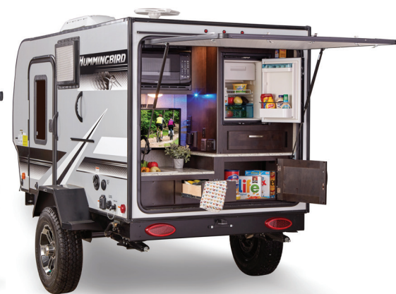
Outfitted with optional roof rack system and Thule® awning